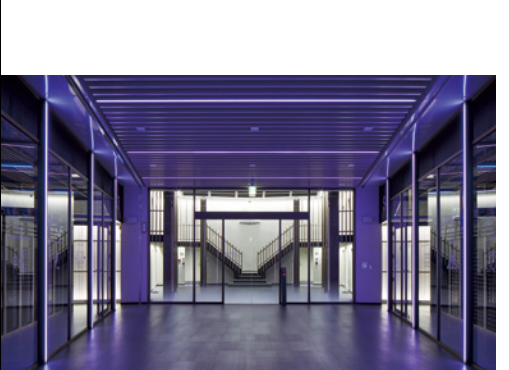
Interio r of Data Center GAK

The Data Center GAK has developed Air he scope of their application to maximize energy savings. We meticulously adopt and use environmentally-friendly technology wherever possible to reduce energy consumption, and as a result, maintain our power usage effectiveness (PUE)<sup>5)</sup> level at close to 1. This is top-level PUE when compared to even the PUEs of global data centers.